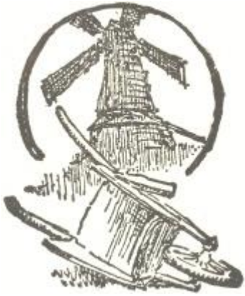
The Remarkable Rocket.