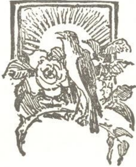
The Selfish Giant.