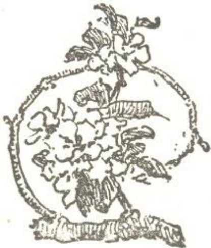
The Devoted Friend.

And when the children ran in that afternoon, they found the Giant lying dead under the tree, all covered with white blossoms.